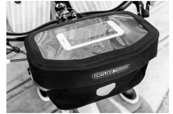
Smartphone in transparent lid compartment (not included)