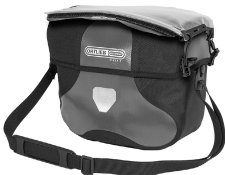
Mounting of optional accessory Ultimate Six Map-Case (not included)