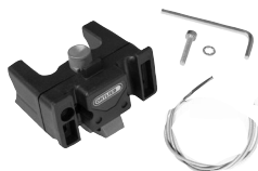
E225 Handlebar Mounting-Set