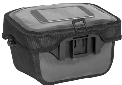
5 L version: smartphone in transparent lid compartment (not included)