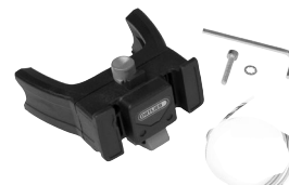
E226 Handlebar Mounting-Set E-Bike