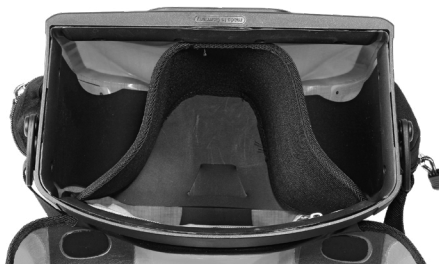
Ultimate Six Internal Divider (not included)