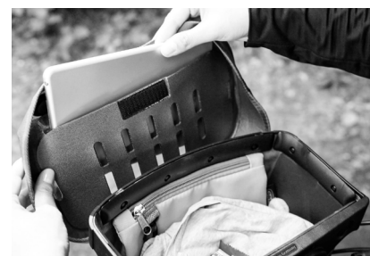
Opening lid compartment: 21,5cm / 8.5in.