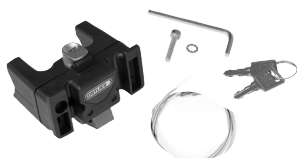
E185 Handlebar Mounting-Set with Lock

Handlebar mounting-set (sold separately):