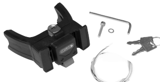
E207 Handlebar Mounting-Set E-Bike with Lock