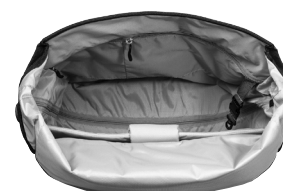
Notebook sleeve for laptops (dimensions 27cm x 40cm x 3cm / 10.6in. x 15.7 in. x 1.2 in)